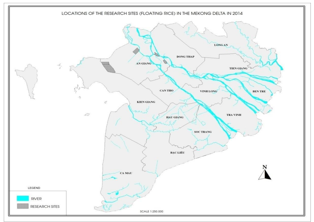
Figure 2: Research sites [floating rice areas] in the Mekong River Delta